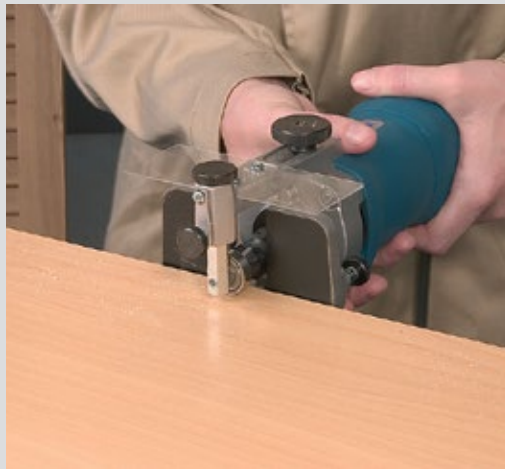
Excellent finishing when trimming laminates.